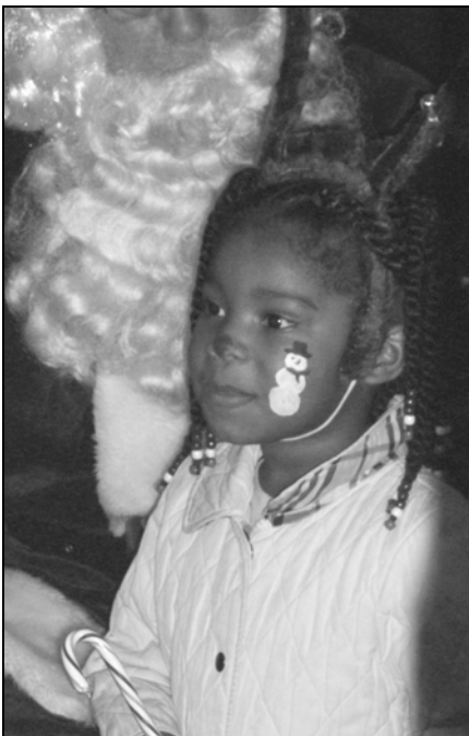
A child from the EHP Christmas Party